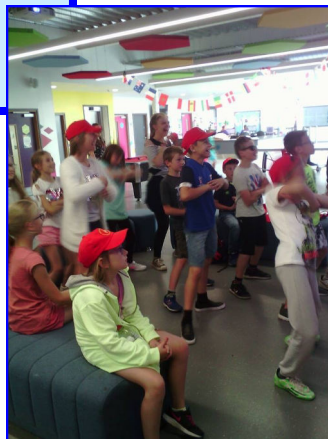
A day of activities at The Hive in Birkenhead