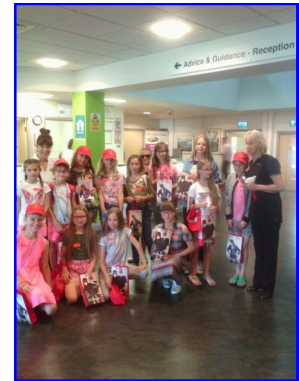
Fun Day courtesy of Kier Construction and Heron JFC