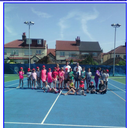
Tennis and a barbecue at Thorndale Lawn Tennis Club